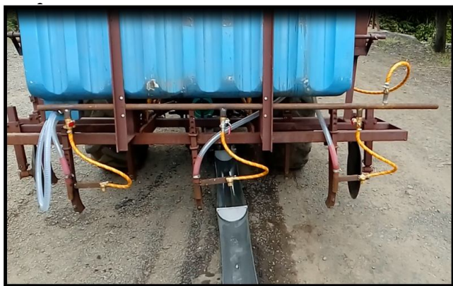
Plate : Laboratory testing of liquid fertilizer application system

calibrated ball valves those were designed and manufactured in the workshop of ASPEE, were tested one by one, by placing the semi circled PVC pipe on the plane surface and then tractor was allowed to passed over it. Four notches of 1m distance each were done in the semi circled PVC pipe, so that when tractor along with liquid fertilizer application system was moving over it, the liquid fertilizer application system will apply the liquid in the notches and dropped liquid was measured with the help of measuring cylinder.